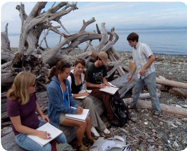
On the beach at the mouth of Oyster River - Day 3