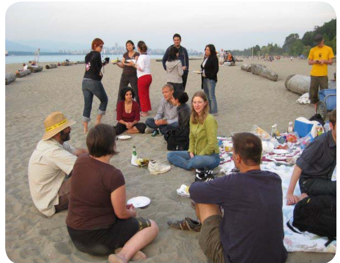
Participants down at the beach