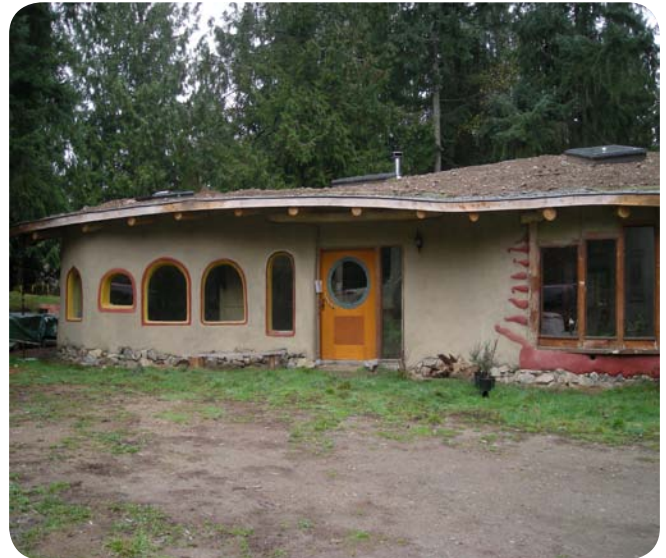
Cob and straw bale construction on site

But living and working in community was far more profound than the regulatory history of the site. The experience transformed my conception of 'community'. This is especially significant considering my chosen career path as a community plan