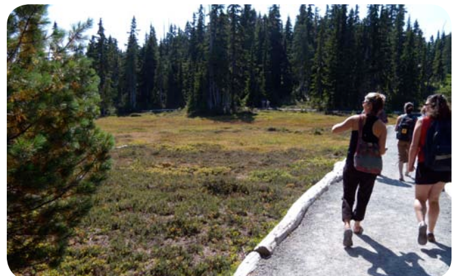
Walking through Paradiase Meadows - Day 1