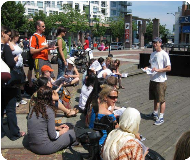
Participants take a tour of the city

This week-long gathering of close to 40 doctoral students from all over the world was the fourth such event held over the past 8 years. This year's topic was "New Frontiers in Planning and Research" and brought two distinguished visiting scholars to